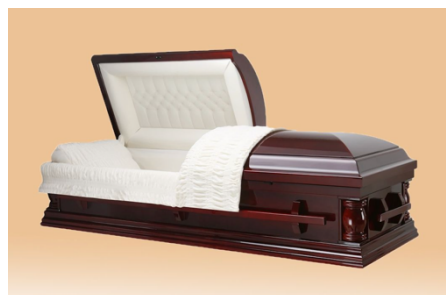
The Honor Casket $1,200 Cherry Color, Poplar Construction, Ivory Velvet Interior